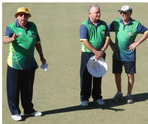
The sponsor in full flight