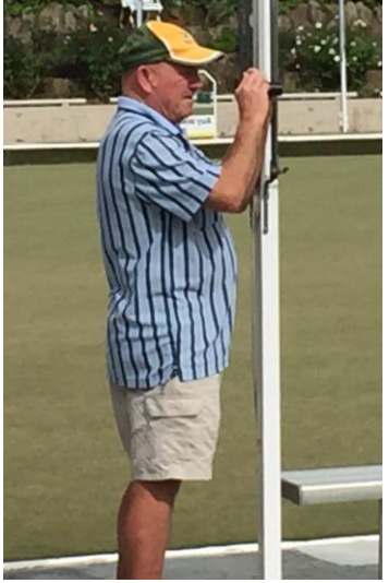
This week's feature photographer