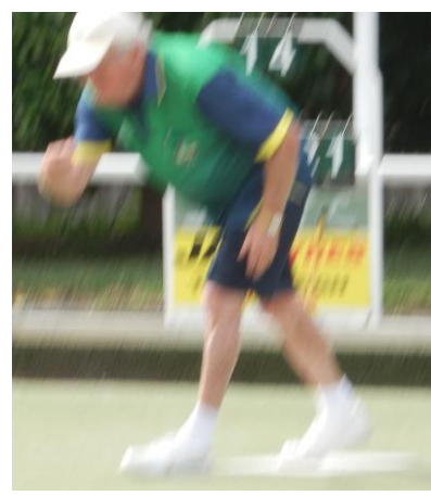
...and some of his best work.