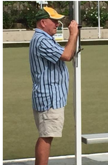
This week's feature photographer