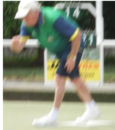
...and some of his best work.