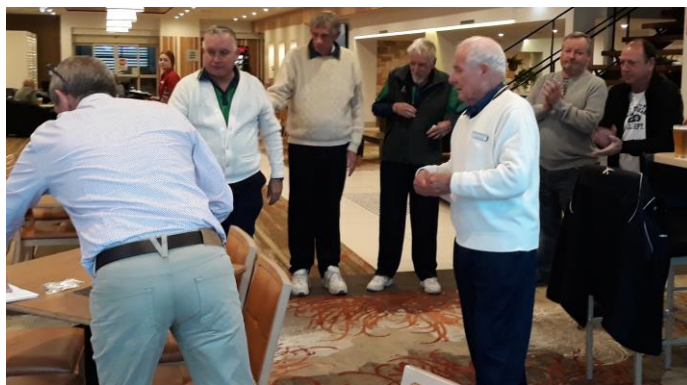
Some of the finalists receiving their prizes. Photo won't win any.