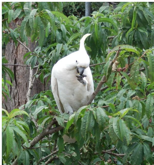
Gratuitous cocky picture