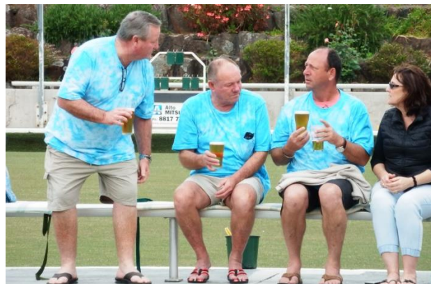
Audience members enjoy the Mixed Pairs final. Male models dressed by Lowes in a traditional tie-dye design