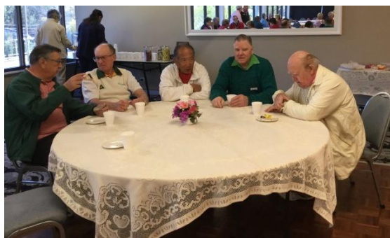
"We thought they would all be wearing pink bikinis"