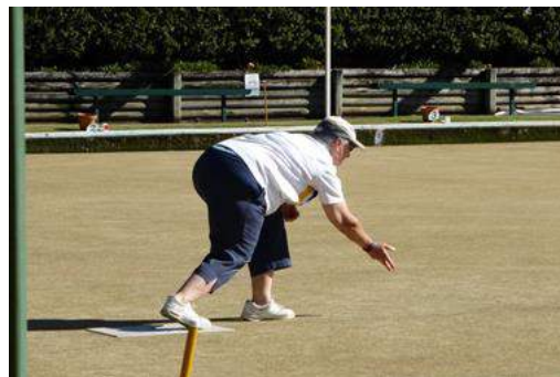
The winning style